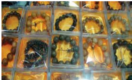
TOP PHOTOS: Historic Chinese artefacts fashioned from rhino horn