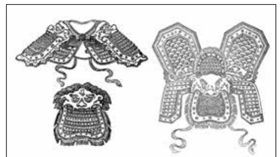
BELOW RIGHT: Illustration rhinoceros hide armour

Through the Qin Dynasty (221-207 BC) and then the Han Dynasty (206 BC-220 AD), rhinos became scarce in the North. By the end of the Han they were all gone from the area of Guanzhou, the region containing the imperial palace, and rhino horns were imported by sea from Sumatra.